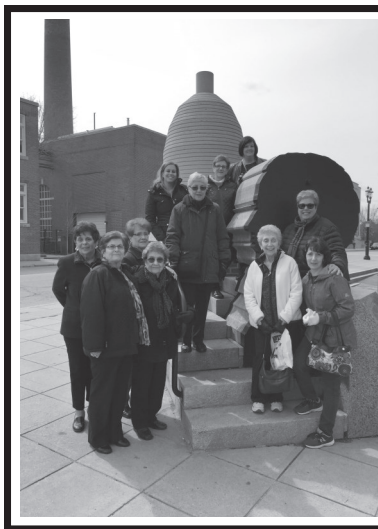
The Women's Guild trip to Lowell on Saturday, April 9, 2016.

Banner forms can be found on our website mtcarmelfestival.com