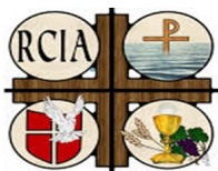
Rite of Christian Initiation for Adults

The lights in the church are scheduled to be upgraded this week. All the hardware in each of the lights will be replaced, along with new LED bulbs, that will be brighter and save us on our electricity bill.